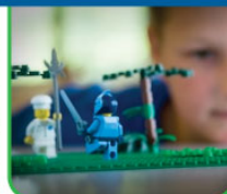
Stop Motion Animation